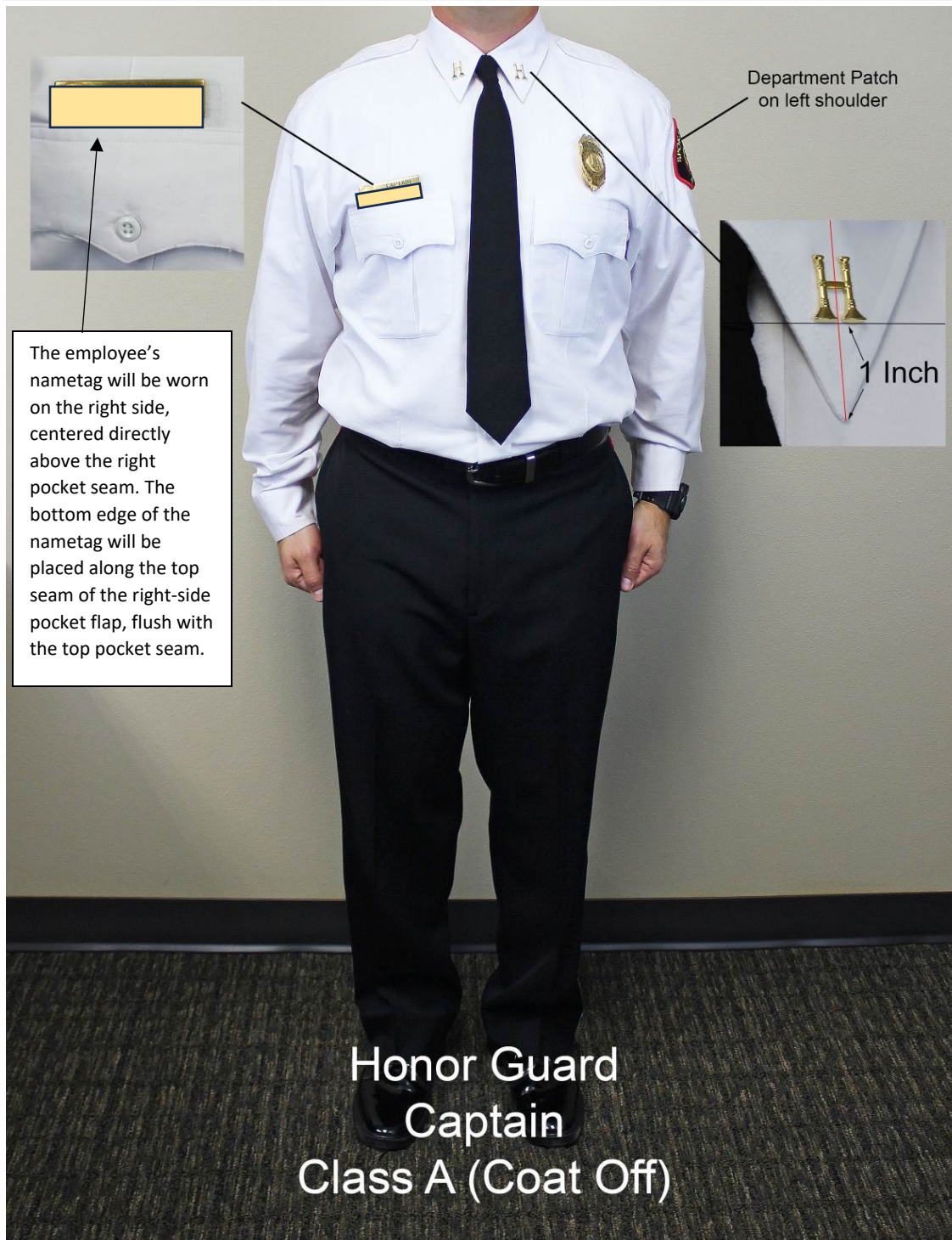
Figure 14: Class A Uniform details show for Captain in Honor Guard (coat off)