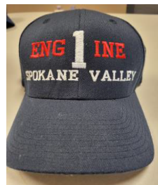
Figure 4: Example of Engine Company Embroidery in Red and White