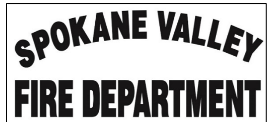
Figure 2: Design for Back of T-Shirt/EMS Coat