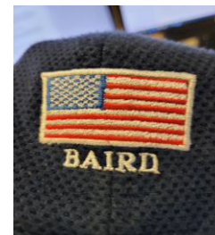
Figure 3: Example of Back of Hat: Small American Flag and Last Name in White