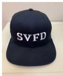
Figure 5: Example of SVFD “BLOCK” Letters Embroidery in White or Red