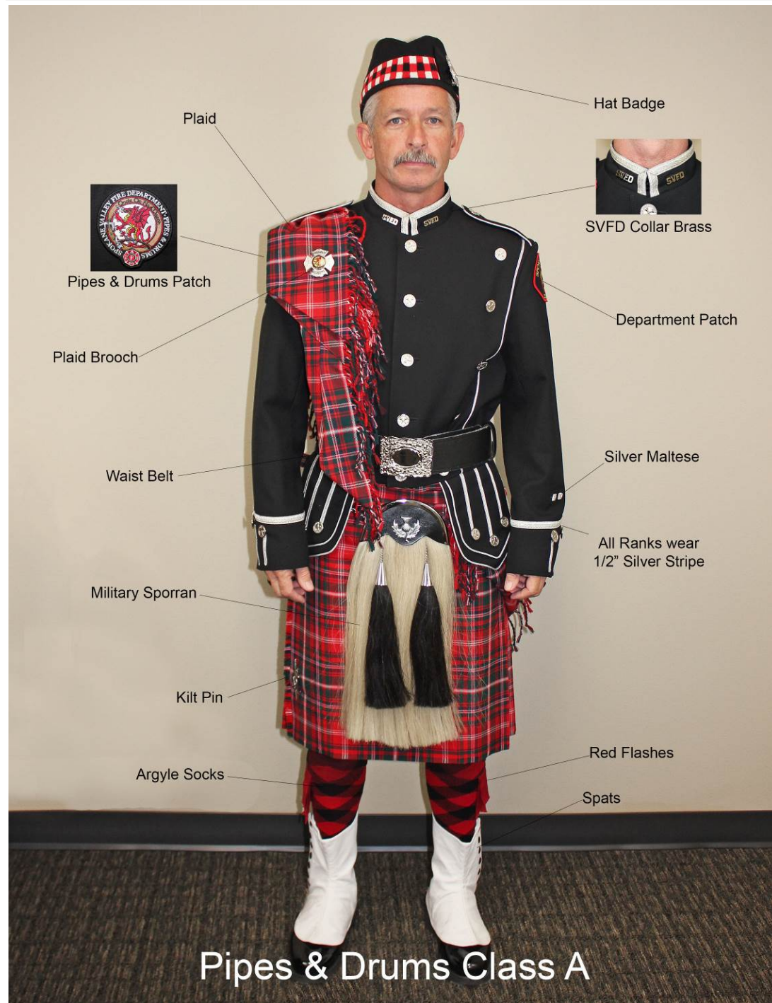
Figure 15: Class A Uniform details shown for Pipes & Drums (all ranks)