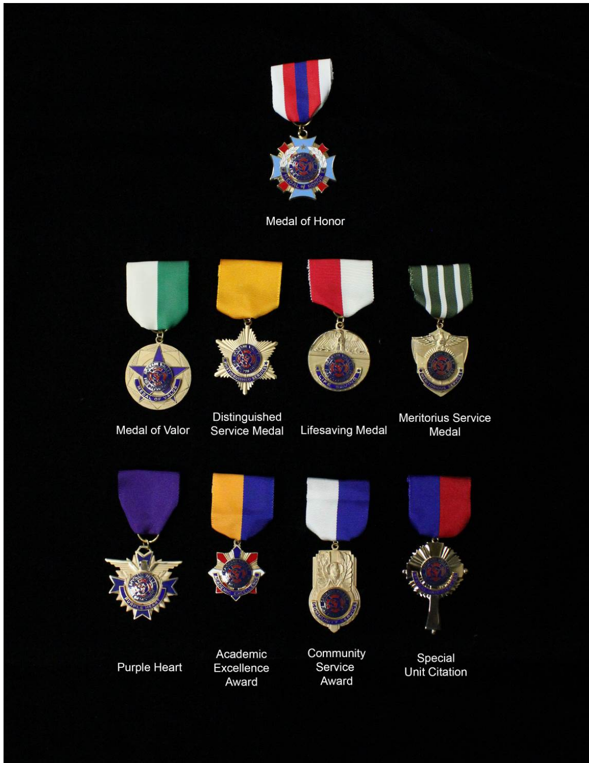
Figure 8: Ribbon Awards from Spokane Valley Fire Department