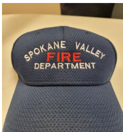
Figure 6: Example of SVFD 06 Logo Embroidery in White and Red