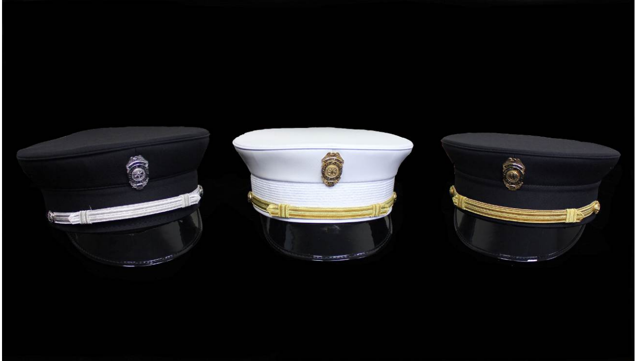
Figure 9: Class A Caps (Left: Firefighter/Engineer, Middle: Chief Officer, Right: Captain)