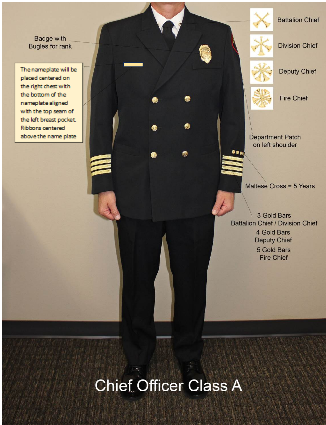
Figure 12: Class A Uniform details shown for Chief Officers