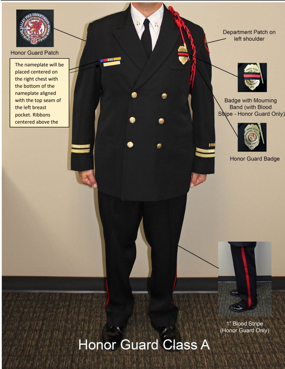
Figure 13: Class A Uniform details show for a Captain in Honor Guard