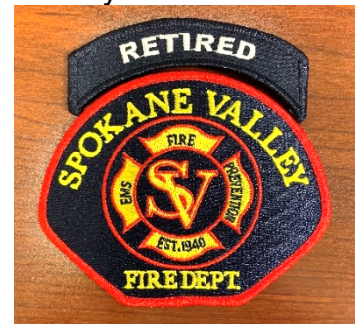
Figure 7: Department patch displayed with "Retired" rocker patch